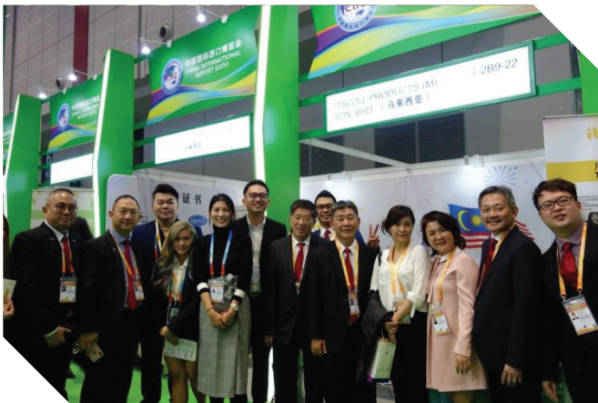
05/11/2018 ~ 10/11/2018 第一届中国国际进口博览会 1st China International Import Expo (CIIE)