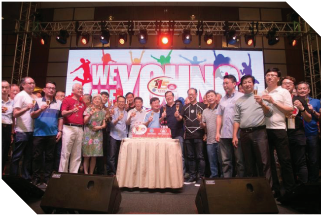
18/08/2018 ~ 19/08/2018 槟州中华总商会115周年暨槟州中华总商会大厦100周年庆典 PCCC 115th Anniversary & PCCC Building 100th Anniversary Celebration