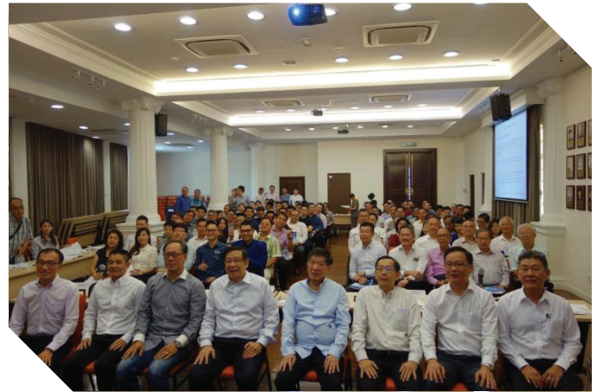
21/09/2018 槟州中华总商会2018年常年会员大会及2018-2021年度董事选举 PCCC 2018 Annual General Meeting cum 2018 -2021 General Committee Election