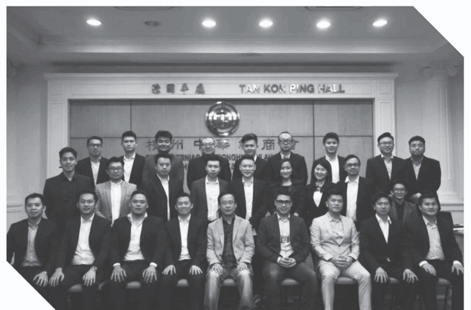
【超越金融风暴】股票投资讲座会 Equity Investment Talk "Rising Above Financial Storms"