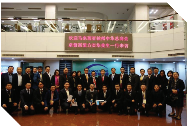
02/12/2018 ~ 05/12/2018 槟州中华总商会赴中国青岛拜访中国国际商会青岛商会 PCCC Delegation to Qingdao, China to Visit China Chamber of International Commerce, Qingdao Chamber