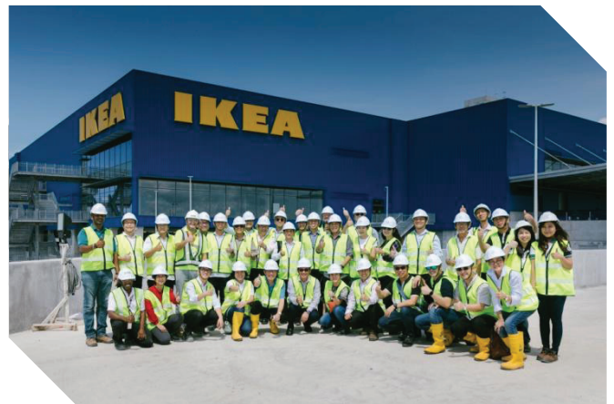
22/11/2018 参观峇都加湾宜家分行 Courtesy Visit to IKEA Batu Kawan